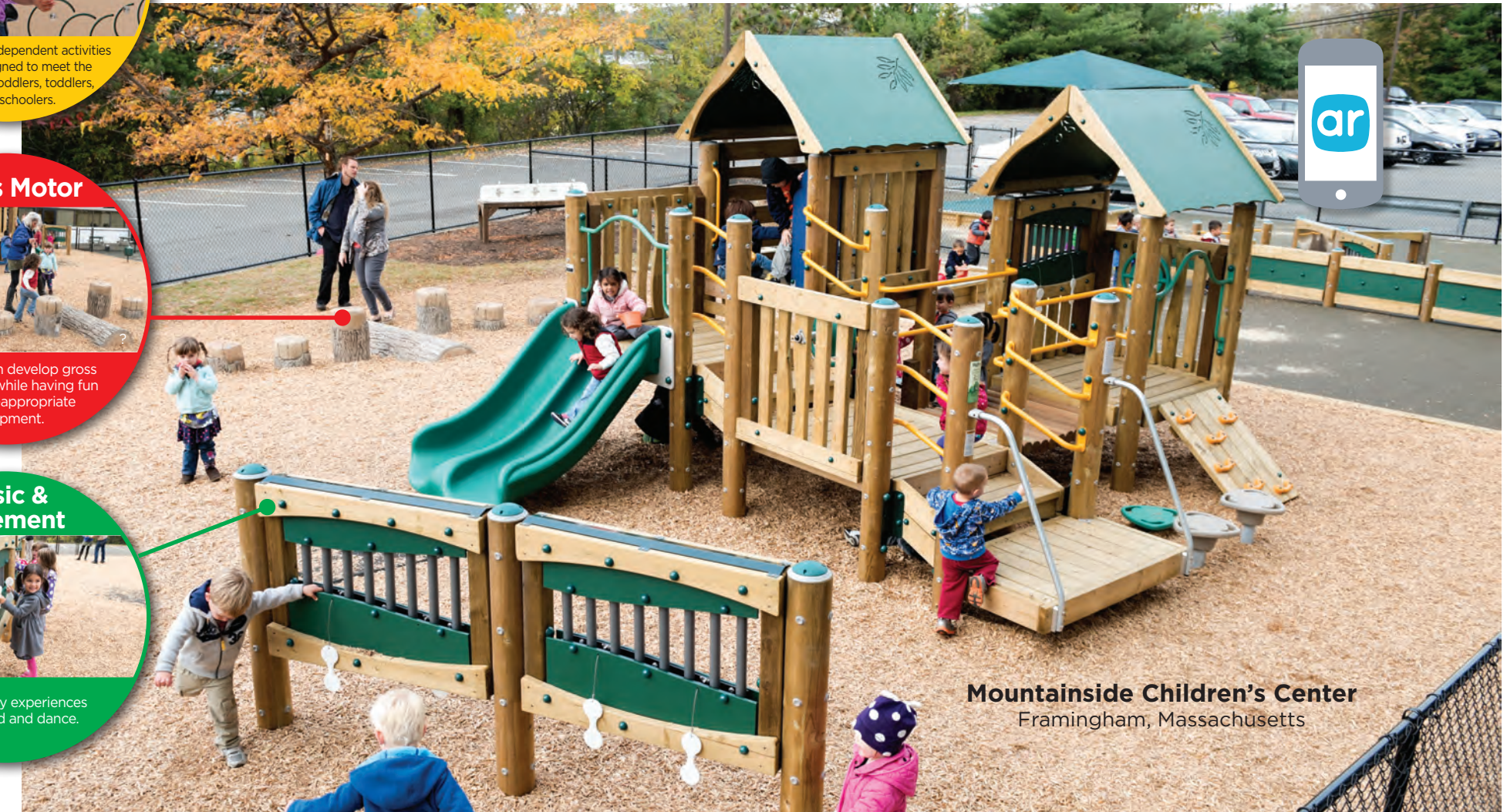
Mountainside Children's Center Framingham, Massachusetts